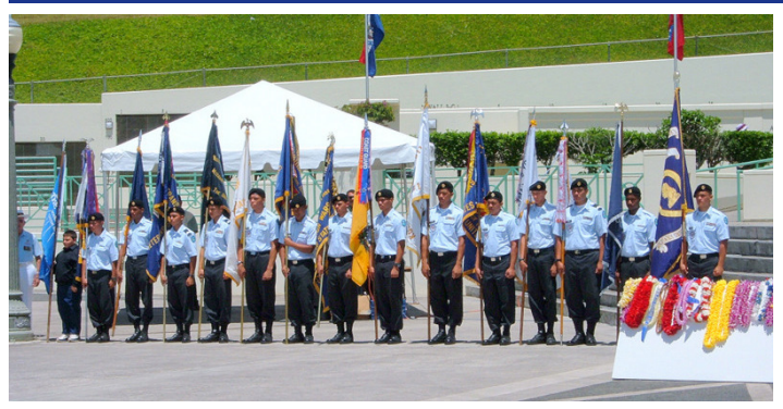
Cadets of the Hawaii Youth Challenge Academy with flags of various veterans' organizations at State Veterans Cemetery

The Hale Koa welcomes all active duty and retired military, Reserve/National Guard members and dependents, current or retired Department of Defense civilians and sponsored guests.